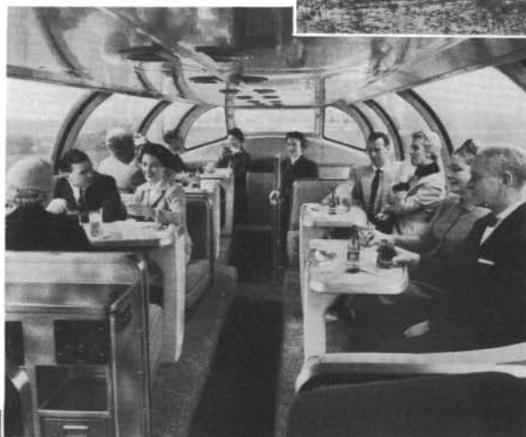
Left — Refreshments are served here, in the upper deck lounge, from the stainless steel bar unit (left foreground) which has a built-in dumb-waiter. Passengers can relax and enjoy the scenery.